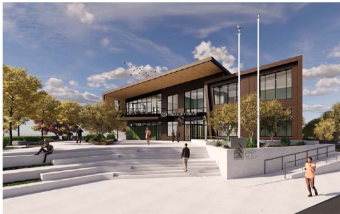
Building rendering by GBD Architects

Resilient is an adjective that means "able to withstand or recover quickly from difficult conditions." The Resiliency Building is designed to resist and embrace the hazards of earth, wind and fire, and includes strategies to mitigate infectious disease.