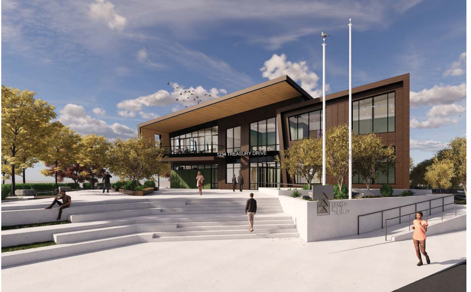
GBD ARCHITECTS INCORPORATED